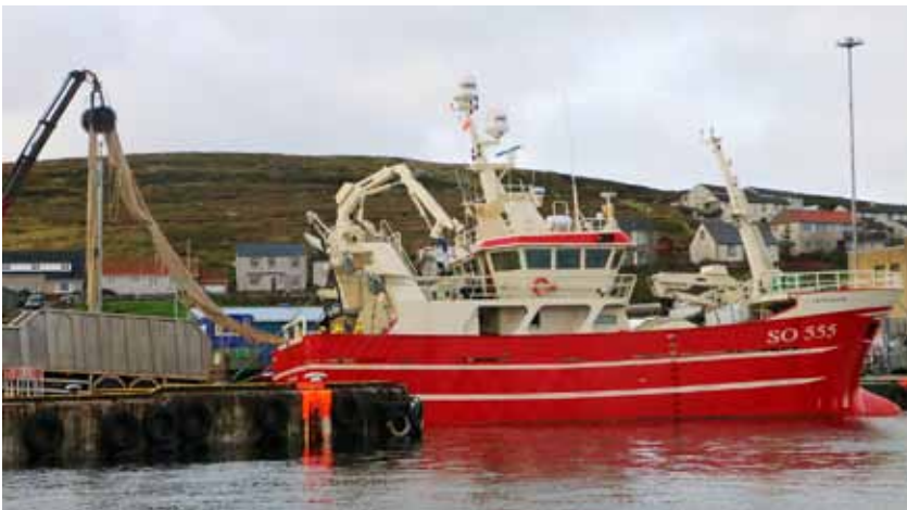
Boarding nets in Lerwick.