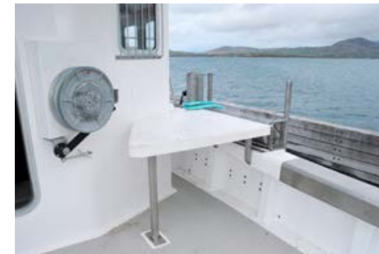
Hauler & Baiting table.