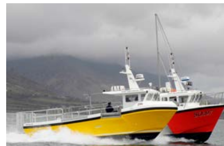
Atlantic Grace & Maverick VI.