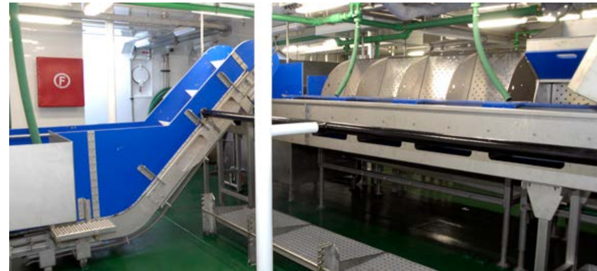
Gutting and sorting station with conveyor from stern hoppers.

For navigation the ship is fitted with the latest model radars, GPS navigators and AIS from Furuno. The main radar, FAR 1518 is fully type approved. It can be controlled with a conventional control panel or with a standard trackball for ease of use. It comes with groundbreaking