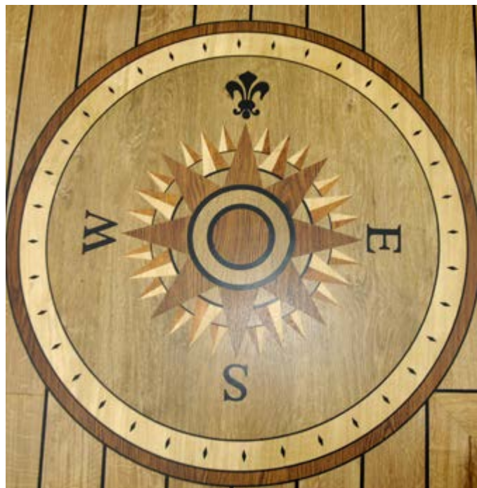
Wheelhouse Floor Compass Rose.