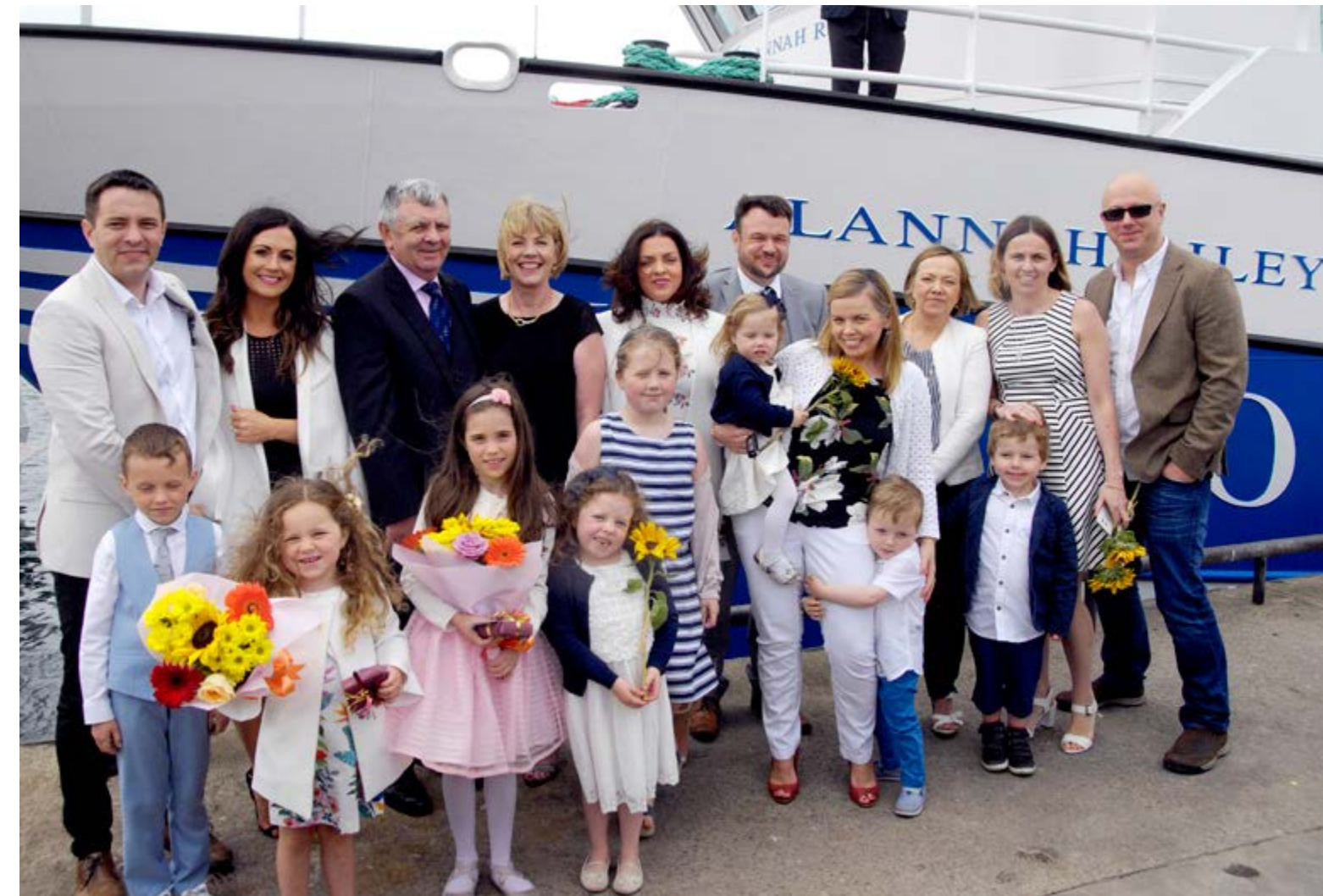
The Minihane family gathered for the official blessing and launch.