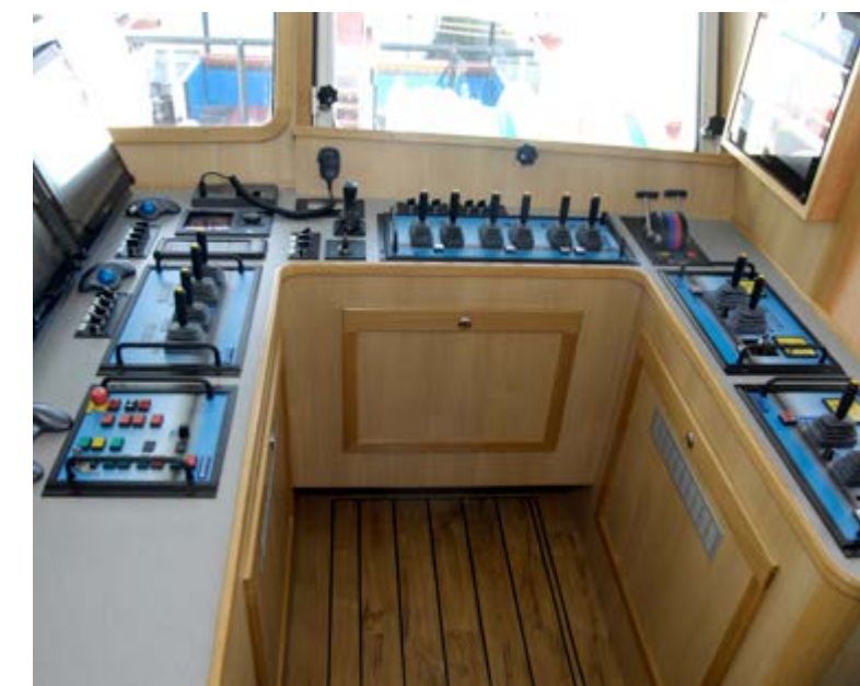
Trawl control station

For deck and ship safety, Barry Electronics have installed the most sophisticated CCTV seen on an Irish fishing boat. Using IP technology the system has 14 cameras and any or all cameras can be displayed on any of five