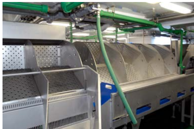
VCU fish washing system.

The dipping machine is equipped with a 9-compartment drum each with a capacity of 63 litres. This drum rotates and ensures that each section with langoustines stays in the preservative bath for 8- to 15 minutes depending on the setting. The 4-compartment washing machine can also be used for processing fish.